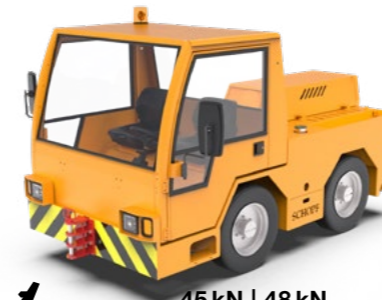
✈ ≤ 70 t 45 kN | 48 kW 57.5 kW | 87 kW | 55.4 kW F 59