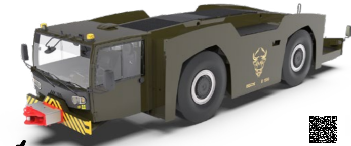
✈ ≤ 600 t 460 kN [2] | 298 kW »BISON« D 1500