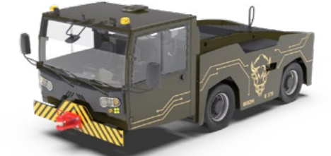
✈ ≤ 125 t 105 kN | 74.4 kW »BISON« E 370