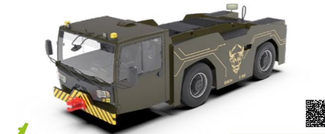
✈ ≤ 250 t 205 kN | 115 kW »BISON« E 620