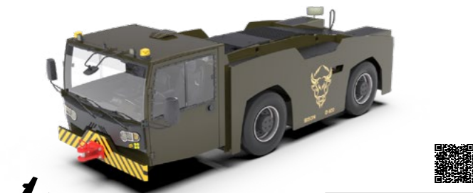
✈ ≤ 250 t 205 kN | 115 kW »BISON« D 620