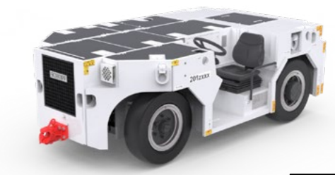
🏠 ≤ 62 t 68 kN | 68 kW STT