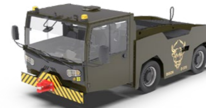
✈ ≤ 125 t 105 kN | 74.4 kW »BISON« D 370