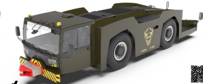
✈ ≤ 400 t 305 kN | 200 kW »BISON« D 1000