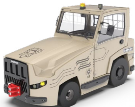
40 kW 25 kN »SHERPA« E