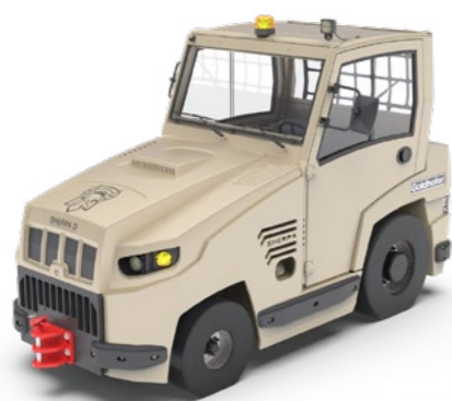
55 kW 40 kN »SHERPA« D