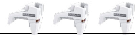
8,000 lbs 13,000 lbs 18,000 lbs