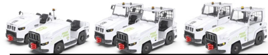
CABLESS OPEN CAB CLOSED CAB CABIN